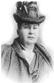
G K & E L

One for garden lovers - something to keep to keep note of – The National Trust were successful in buying Munstead Wood in 2023 and are now busy fund-raising with the aim of opening to the public in due course. Why is this great news? If you're a garden lover you won't need to be told but for those who are just curious, after 74 years of this internationally significant garden being in private ownership, this 11-acre garden surrounds an Arts and Crafts house that showcases Gertrude Jekyll's collaboration with architect Sir Edwin Lutyens. It's the place where, from the 1890s to her death in 1932, Jekyll grew her influence on national and international garden design, transformed horticultural practice, and inspired others to become gardeners through her books and more than 1,000 articles. We're eagerly awaiting the day when it will open!