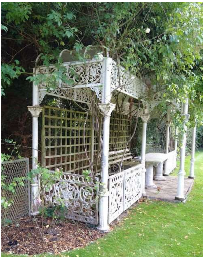
Fish 'n Chip stall from a Welsh market