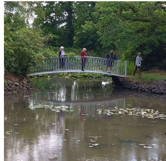
Willow Pattern Bridge?

Thanks to all contributors. All contributions gratefully received by the editor! Please send your contributions for the October Newsletter to me by Friday 21 st September.