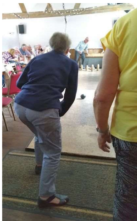
Set 'em up again, guys