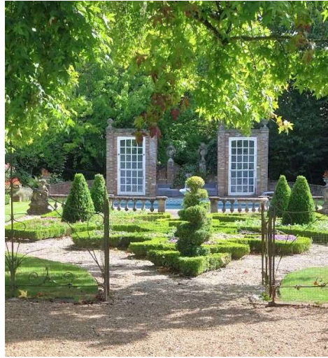
Windows from the old Regency Cinema in Brighton