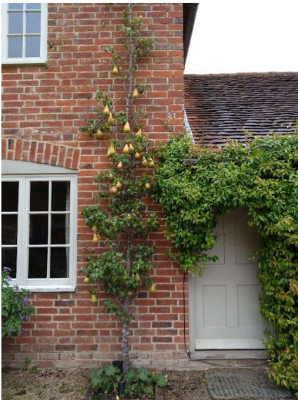
Easy access pears!

The last garden visit for this year and the weather was not so kind to us this time. However, gardeners and garden lovers alike are a hardy breed and there was plenty to enjoy and be inspired by too (including a most excellent brownie cake!)