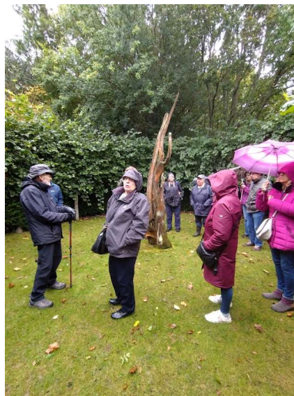
What is it?