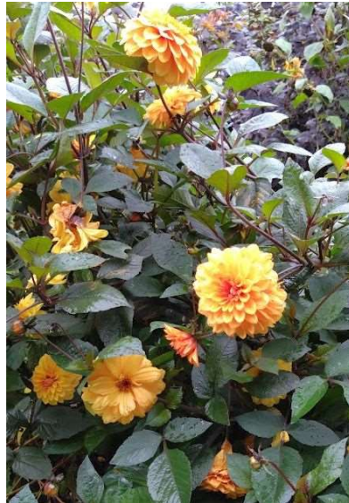
Plenty for dahlia lovers